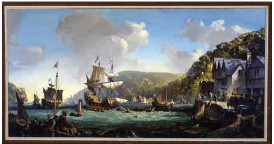
Mayflower & Speedwell in Dartmouth Harbour

We travel to Plymouth, stopping in Dartmouth for lunch, a look at the harbour where both the Mayflower and the Speedwell set sail from only to return to Plymouth when the Speedwell sprang a leak.